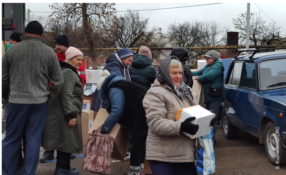
Distribution of items for poultry farming to affected population.