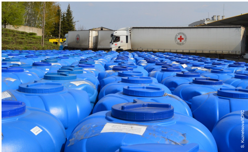
Water storage tanks for distribution to healthcare institutions and centers for displaced persons.